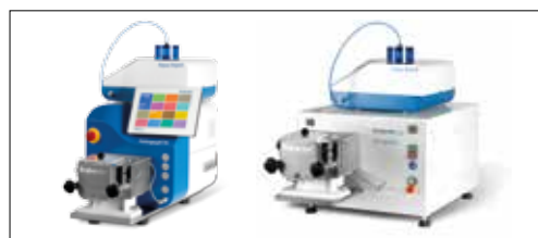
Farinograph-TS and Farinograph-E (USB) with Aqua-Inject