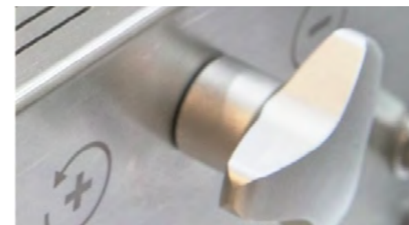
Threaded spindle for adjusting the blade-die distance

by exchanging the die insert on the extruder and adjusting the cutting gap for different lengths, easy and exact positioning of the distance between blades and die by means of threaded spindle